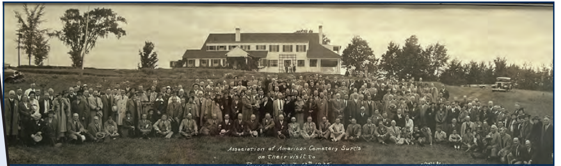
September 13, 1935 Superintendents Meeting