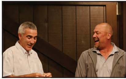
June 29 Celebration