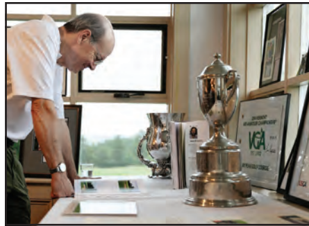
June 29, 2024 Celebration