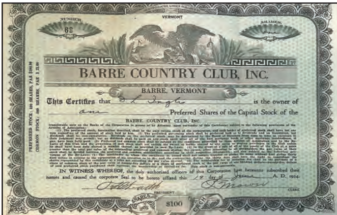
Original Deed January 1924