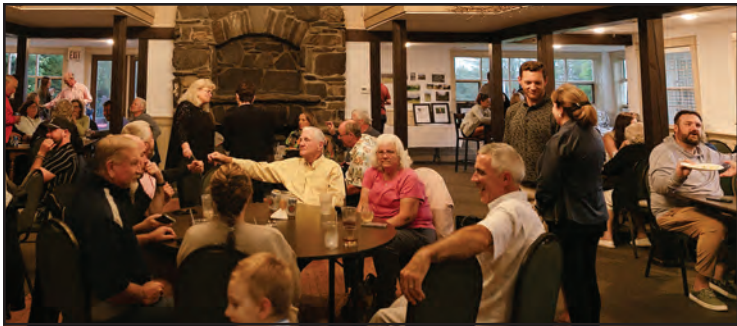
June 29, 2024 Celebration